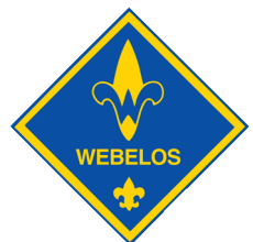
Webeles 4th Grade